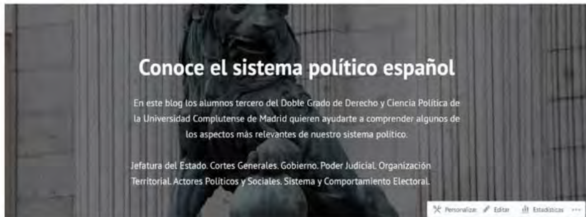
Figure 2. Covers of blog

proposed by Delors (1996) can be applied to them: learn to be, to know, to do and to live together. Our blog entitled: "Get to know the Spanish political system" is no exception. A blog that is made up of 28 different entries that are related to the following topics: head of state, parliament, government, judiciary, and territorial organization ( Figure 2 ).