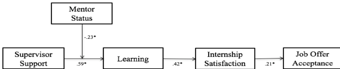
FIGURE 2: Path analytic results.

internship was paid versus unpaid, and whether the internship was full time or part time in all our models and our path analytic results remained significant.