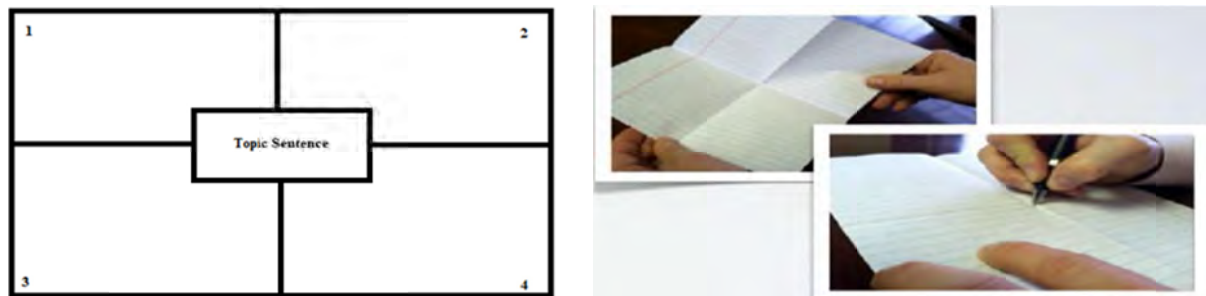
Figure 1. The FSWM worksheet