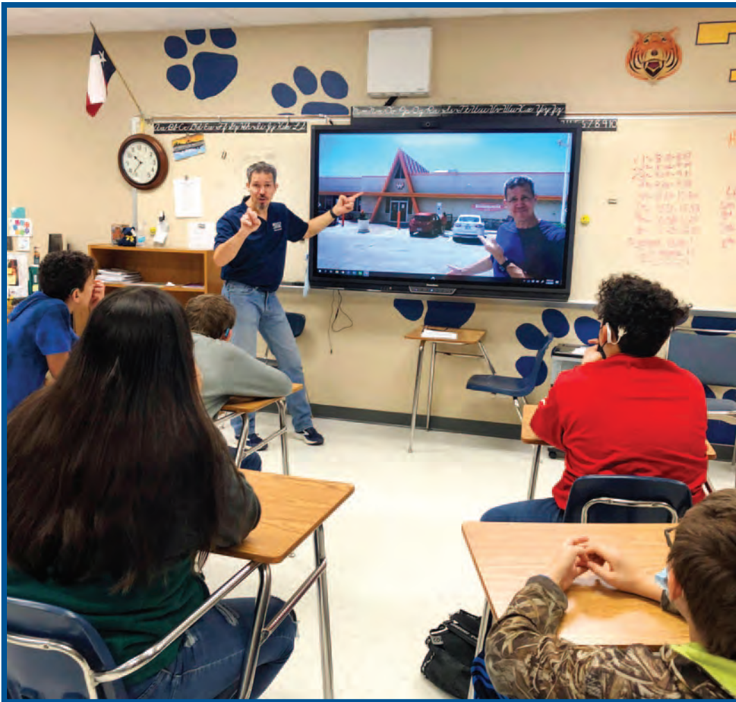
Left: In addition to important sites of history, culture, and industry, “hooks” are included to draw student interest, such as the first Whataburger restaurant in Corpus Christi.

visit cities throughout Texas—all while improving their knowledge of geography, history, and culture within their state and remaining in their classroom.