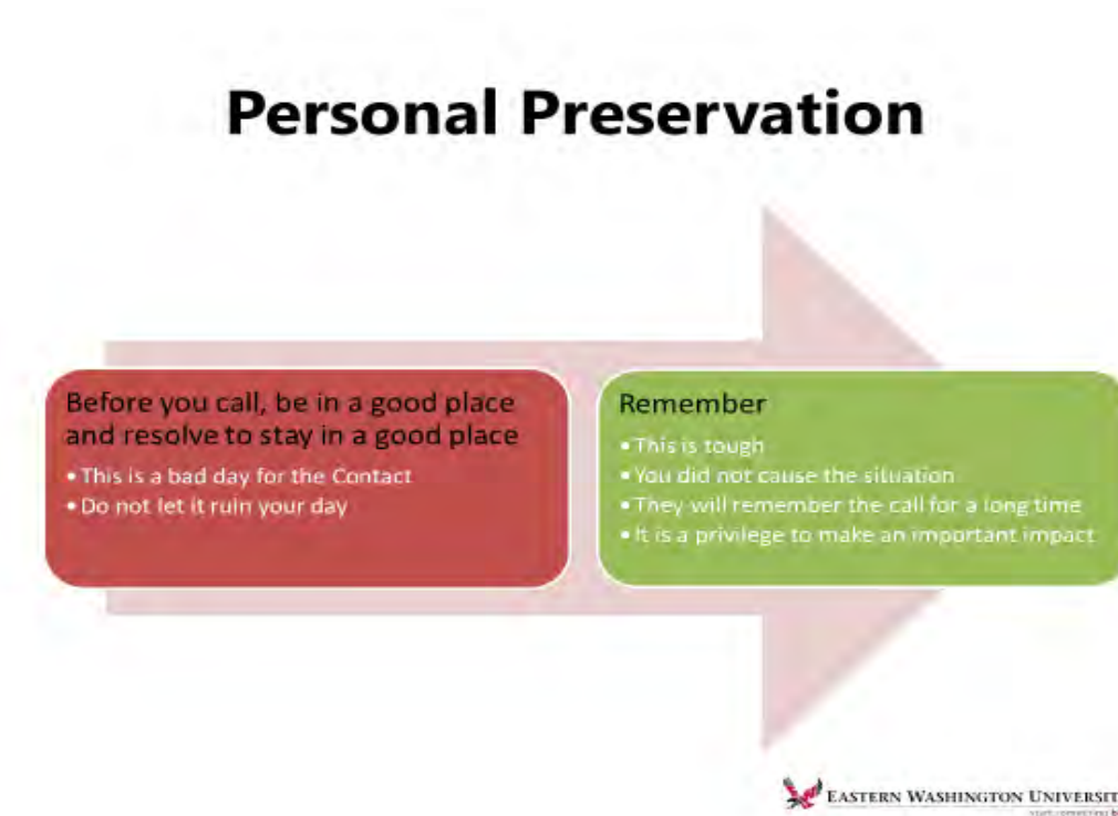
FIGURE 3. Personal preservation slide

The contact tracing training ended with small group mock contact tracing calls, which allowed each student to be a contact tracer, a COVID-19 contact, and an observer of the process, using scenarios that helped students gain confidence in their roles as contact tracers. The scenarios were built on content previously covered within the training program. There were six different scenarios, so each student practiced with a different mock case, including contact demographics and social arrangements.