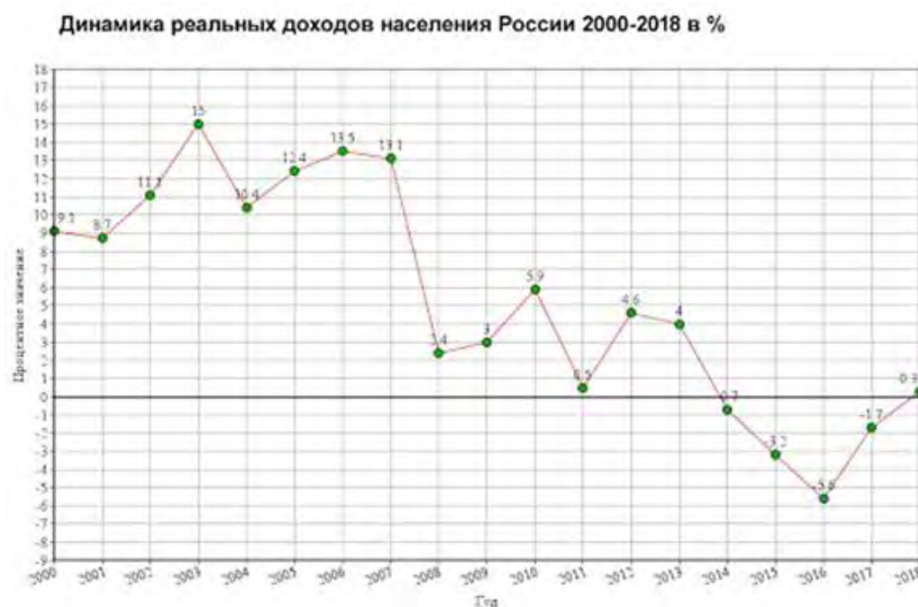
Figure 1. Dynamics of real incomes of the population of Russia 2000-2018 in %

An essential indicator of the Russian economic situation is the dynamics of the real incomes of the population. In this case, even such an official source as Rosstat (Federal State Statistic Service) records the annual drop in income since 2007 (Federal'naya sluzhba gosudarstvennoj statistiki, 2020). The graph evidences this (Figure 1).