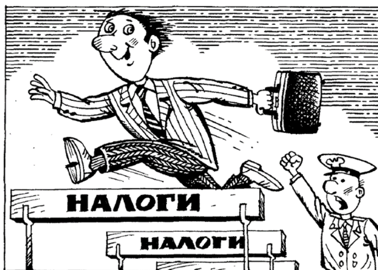
Figure 2. A picture serving as an illustration of the situation with many taxes in Russia and the reluctance of entrepreneurs to pay them (Kravchenko, 2010, 93)