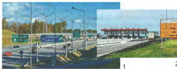
Участок трассы М-11 (1) и пункт оплаты (2)

Построена Федеральная автомобильная трасса М-4 «Дон» по маршруту Москва – Воронеж – Ростов-на-Дону – Краснодар – Новороссийск. Протяжённость автодороги составляет около 1540 км. В ближайшее время планируется ввод в эксплуатацию скоростной федеральной автомобильной дороги Москва – Санкт-Петербург (М-11). Общая протяжённость автомобильной дороги Москва – Санкт-Петербург составит около 700 км. Это одна из первых крупных автодорог России, проезд по которой на отдельных участках будет платным. Государство обеспечивает 75% финансирования строительства этой автотрассы, а также предоставляет проектно-сметную документацию и осуществляет подготовку территории.