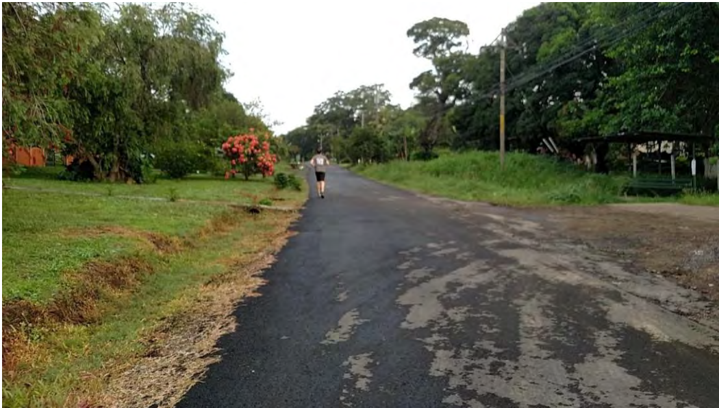
FIGURE (2): PHOTO OF THE LONG ROAD LEADING TO THE CENTER. UPON CLOSER EXAMINATION, THERE ARE WALKWAYS AND GATES LEADING UP TO HOUSES THAT ARE SET BACK FROM THE STREET

The academic programs of the Field Research International are all based in The Center. The Center contains a wealth of resources with a residence hall, classroom space, dining area, apartments for faculty and visitors, a soccer field, swimming pool, organic farm, and more. The students live, eat, take classes, and play at the center for either a semester or a month-long summer program. Students can leave the Center during the day when they have free time; however, they must return by a designated curfew. The curfew illustrates the tension the administration of The Center faces trying to promote the safety and security of the students but implementing something that may be seen by community members as potentially limiting opportunities for interactions later in the evening. Frequently, when students leave The Center, they either go for a run, a short walk to buy ice cream from a local vendor, or are meeting a taxi to drive them downtown.