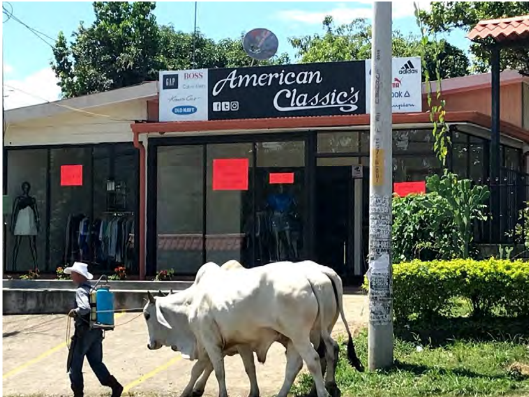
FIGURE (1): PHOTO OF A LOCAL FARMER WALKING CATTLE THROUGH THE CENTRAL COMMERCIAL AREA OF PACIENCIA, COSTA RICA. WHILE NOT A REGULAR SIGHT, IT IS NOT UNCOMMON TO SEE THIS COLLISION OF CITY AND FARM IN TOWN

As a town, Paciencia shares a split identity of being close to the capital city of San Jose and yet being far removed and away from the busyness of the big city. Paciencia has a population of nearly 30,000 and is about a one-hour drive from San Jose within Costa Rica's central valley. It has a downtown with a park and church at its center, as is the case of most Central American towns and cities, but is also surrounded by hills, forests, and farms.