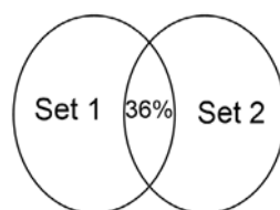
Figure 2: The shared variance by two data sets

and self-regulation of effort (SR) had the lowest level of canonical load (.76) in the second data set. Figure 2 shows the shared variance by two data sets, as determined based on canonical correlation analysis findings.