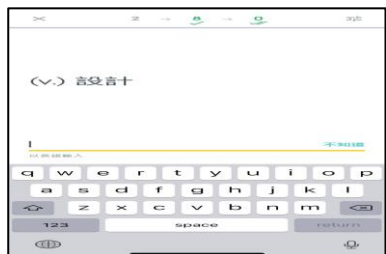
Figure 2. Learn study mode