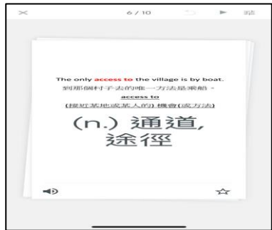
Figure 1. Flashcards study mode

(2) Learn: there are three question types in the Learn mode—flashcards, multiple choice questions, and writing questions (see Figure 2). The system shows each vocabulary item randomly and tracks users' vocabulary learning progress. When students give the wrong answer, the system shows the correct answer for students. They can memorize target words through repeated practice with these three question types.