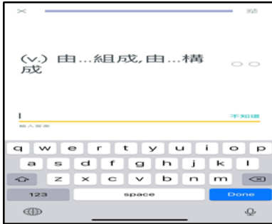
Figure 3. Write study mode

(3) Write: it is to spell the word form based on a cued vocabulary item (see Figure 3). The student is prompted by the Chinese definition on the screen or hears the English word pronounced from the system, and then spells the word form.