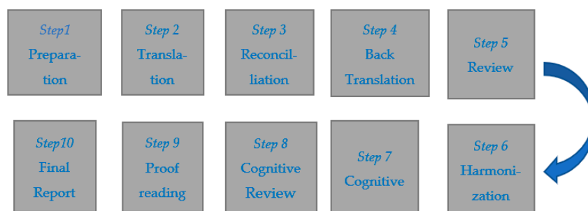
Figure 1. Steps involved in the translation and cross-cultural adaptation process of the MBC.

The translation and cross-cultural adaptation processes used in this study, as previously mentioned, followed the major guidelines suggested in the works of Wild et al. (2005) and Mondrzak et al. (2016). The process included ten steps, as illustrated in Figure 1 and Table 1. The Ethics committee of United Arab Emirates University (UAEU, Protocol No ERS_2021_7335) approved the project.