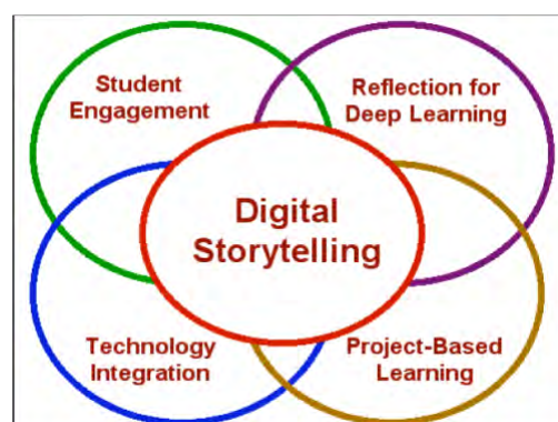
Fig. 1. Student-centered learning strategies convergence (Barrett, 2005)

The digital story method is about researching any subject, writing a script, creating an interesting story, bringing together and recording the story with multimedia tools such as appropriate sound, music, graphics in the computer environment (Robin, 2008). According to Barrett (2005), in the realm of education, digital stories are a synthesis of four student-centered learning strategies: student involvement, reflection for deep learning, technological integration, and project-based learning.