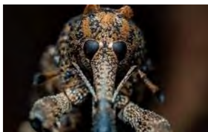
Figure 1. False micrograph of the coronavirus

Social media allows information to be easily shared and can serve to promote half-facts and rumors, particularly when a large volume of people obtain their news from such outlets (Mitchell et al., 2020; Talwar et al., 2019). Ascoott (2020) asserts that the persistent menace of fake news on the Internet requires real solutions as web-based news and social media have grown in popularity over the past few years, a consequence of which is that a whole new genre of information has entered the lexicon: fake news. Acceptance of false news has recently been found to pose a risk during the COVID-19 pandemic. Although awareness of the issue is widespread, preventing the dissemination of fake news requires fast action from social media outlets, reporters, and fact-finders. Figure 1 presents a fake photo of COVID-19 (an alleged micrograph of the coronavirus) that was shared on WhatsApp and Facebook in March 2020.