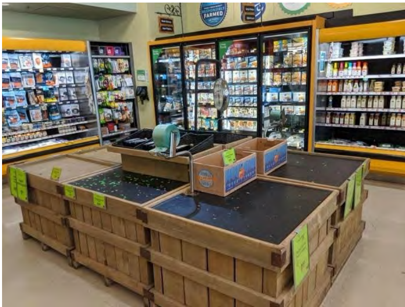
Fig. 2: Panic shopping