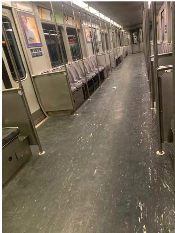
Fig. 1: Empty train