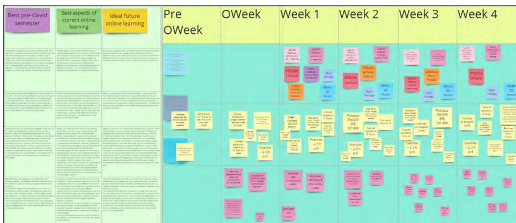
Figure 2: Visual impression of text-based responses and flowchart

While the content is not legible, these images provide a visual impression of the initial detailed text-based responses (left) followed by the creation of flowcharts (right) to depict a range of experiences throughout a semester.