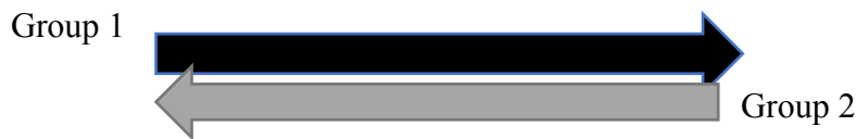
Figure 1. A visual representation of a continuous exchange of ideas

In a debate the point is not only for responders to share their reasons and position but to acknowledge the opposing view, respond to it and share their position and reason. This process requires that the responder will listen to the argument the peers make, respond to it first, show how it is not valid, and then reply with their reason (See Figure 2 with a visual representation of a debate).