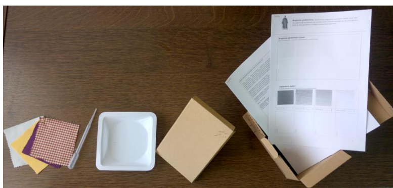
Figure 1. Activity Kit and the Sample Fabrics

In the activity named "Can Nanotechnology Keep Us Dry in the Rain", it is aimed that the students determine the most suitable and useful fabric for raincoat production among the sample fabrics offered to them by conducting an authentic inquiry. For this aim, teacher give students a task in which they are in charge of selecting textiles at a factory and must selecting the right fabric. To do so, teacher ask them to observe and touch a different set of fabrics and express their starting ideas based on their existing ideas and previous experiences (see figure 1).