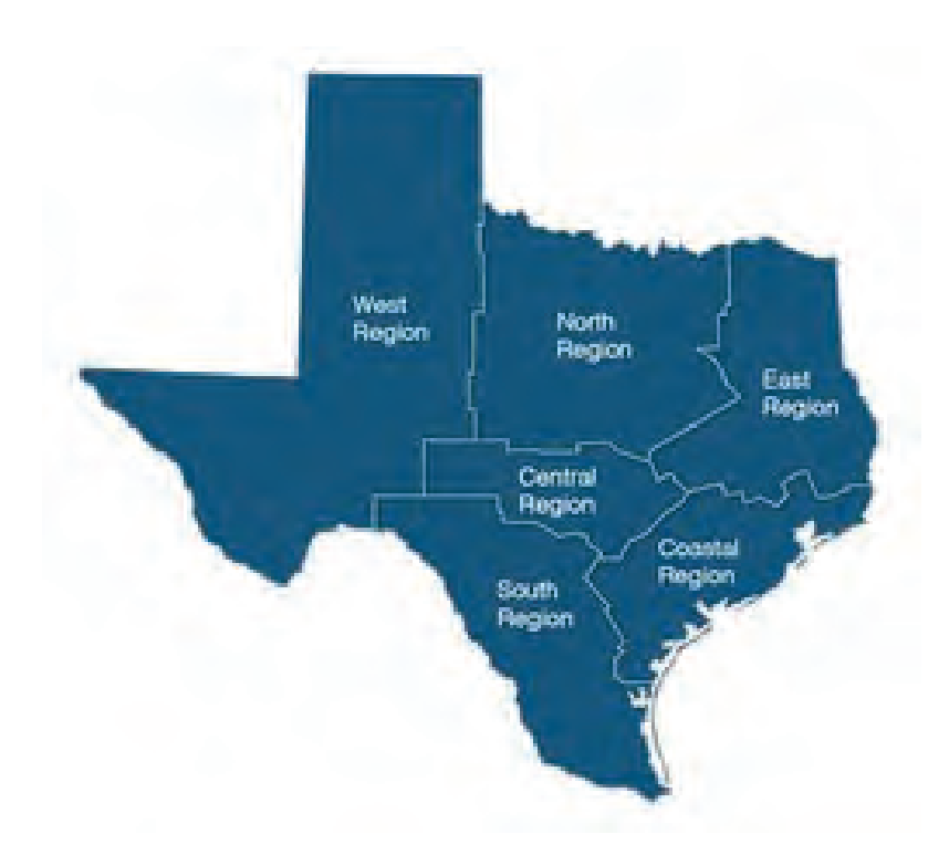
Figure 1. Community Outreach Coordinator regions.

As the partnership continues to evolve, AgriLife Extension and TCDD are focusing on high content activities through content transmission and transformative education approaches. Content transmission activities include dissemination of disability-related resources and education through bimonthly newsletters, localized resource guides, and ongoing webinar series; transformative learning activities include opportunities that allow/will allow disability experts to provide single-event training opportunities for county Extension agents, childcare providers, and other service professionals. Education delivered within this approach is focused on applicable, practical training that clientele can adopt in their everyday practice.