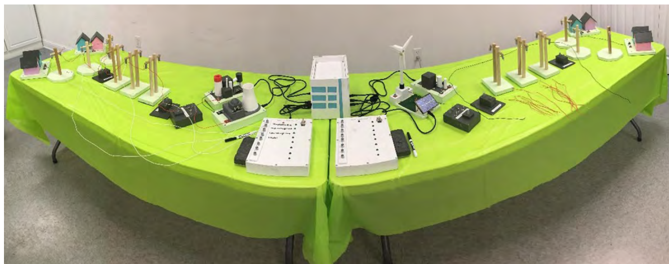
Figure 1. Smart grid for schools kit used for developing hands-on learning activities.