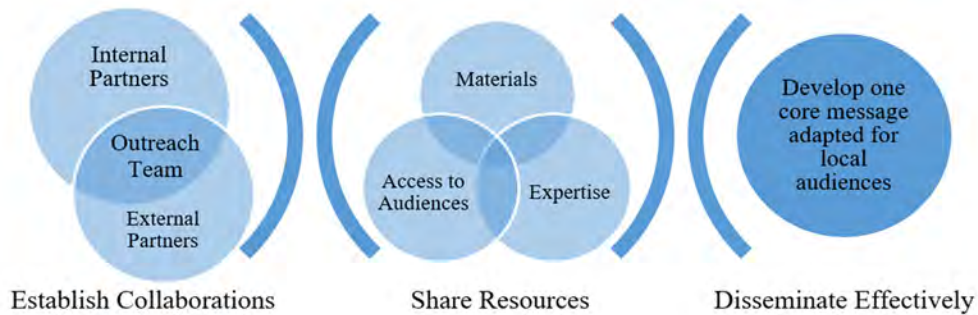
Figure 5. Model for engaging hard-to-reach audiences through internal and external collaborations.