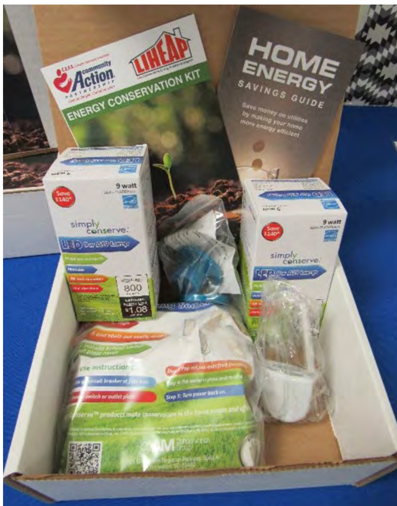
Figure 3. Home energy conservation kit. Adult program participants received an energy conservation kit containing LED light bulbs, an LED nightlight, an air filter whistle, and foam-insulating gaskets.