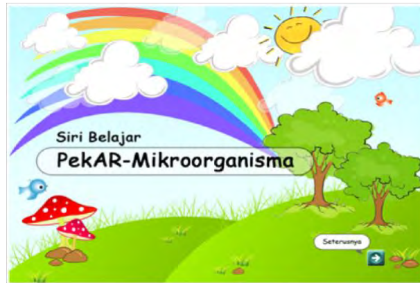
Fig. 2 The Introduction of PekAR-Mikroorganisma