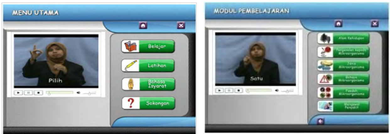
Fig. 3 The Main Menu and Learning Module of PekAR-Mikroorganisma