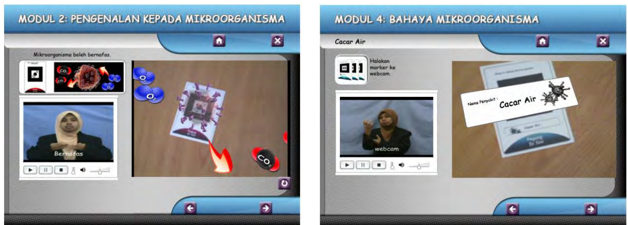
Fig. 4 Example of AR environment in courseware in module 2

The first screen in the courseware is the main display screen which can be seen in Fig. 2. The display starts with the name of the application which is PekAR-Mikroorganisma . “Pek” stands for Pekak or in the Malay language it means the hearing impaired. “AR” is augmented reality and Mikroorganisma means Microorganism. A multi-coloured interface with pictures of mushrooms was