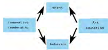
Figure 3. Leadership and art education

The definition is based on the concept of innovation in art education. It is to observe, understand, and do something in a new or unique way. It may be a new idea in people's mind, an idea that exists or has existed in society. What is innovation? If such a response is innovation, it can be introduced into the entire system of society, and it is a new way of doing things. Innovation is conceiving, developing, or discovering new ways of connecting something. Innovation is the relationship between the individual and society, because it involves this connection not only between form but also between meaning, especially between artists, art and society. Innovation is not purely in one's thoughts, but a qualitative change that occurs under the interaction between one's thoughts and social culture. It is essentially a social activity. Discuss the cultivation of creative thinking ability. Innovation involves new possibilities and discovers the connections between different ideas. Innovation ability is when innovative ideas or viewpoints that can obtain new benefits are used to solve difficult problems in reality.