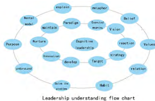
Figure 4. Leadership understanding flow chart

Artists consider leadership and art education to guide students' lives and careers in many places, which helps to develop design research in this area. The scope of this project involves theory, research, methods, and practice results in leadership art education. On the basis of leadership art education through theory, practice art education and the experience of art educators. Cohesion requires analysis and participation in art education teacher leadership literature research. Aims to highlight innovative leadership in art education. Through personal reflection, job definitions and examples will develop leadership innovation.