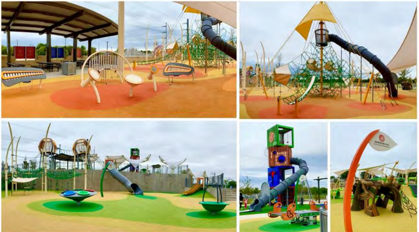
Figure 5. PlayGrand Adventures Phase 1 Photographs

Note. Photos taken by the author during on-site observations.