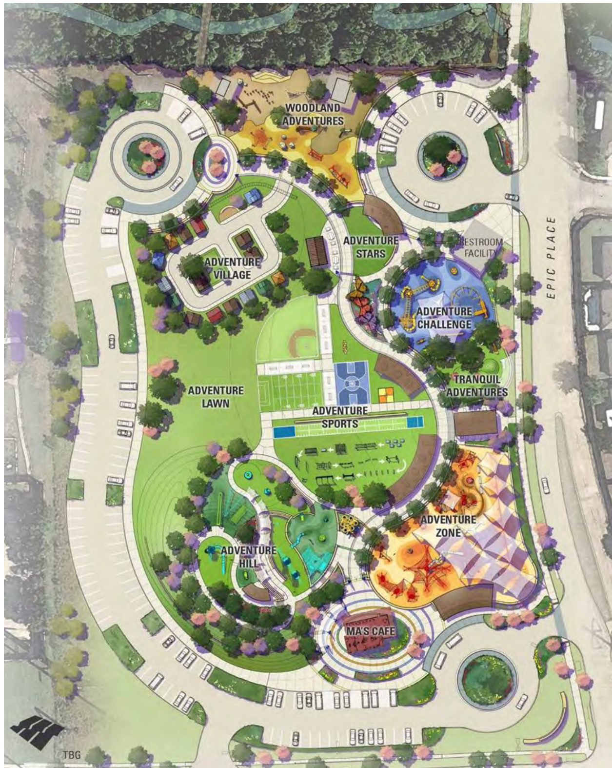
Figure 3. PlayGrand Adventures Master Plan