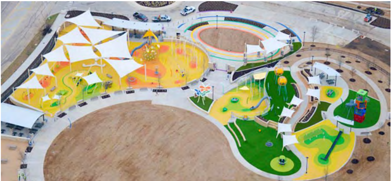
Figure 4. PlayGrand Adventures Phase 1 Play Zones Rendering

Note. Adventure Zone (left) and Adventure Hill (right). From www.playgrandadventures.com . Reprinted with permission from City of Grand Prairie Parks, Arts, & Recreation.