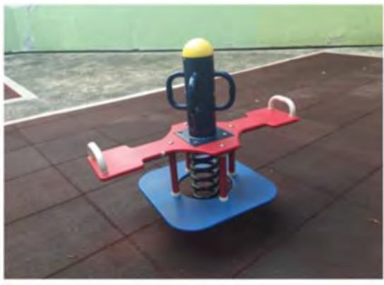
Figure 1. Comparison of Accessible and Inclusive Seesaws