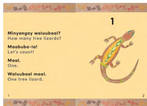
Figure 6. Example from book adapted from flashcards.

Our final book was based on the flashcards we had developed for teachers to use in counting from one to ten; Maabuba-la-Let's Count! (Smith, 2019e). This used commissioned artwork by another Gamilaraay artist who has links to Winanga-Li, as shown in Figure 6.