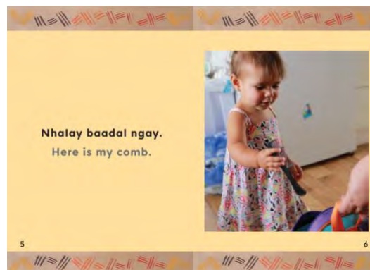
Figure 3. Example from photograph-based book.

Since staff members often talked about children staying with their grandparents, we organised a photography session with a Gamilaraay teacher who is a keen photographer and the granddaughter of a staff member. The story Gundhi-gu Badhii-ngu-To Nan's House (Smith, 2019b) was then developed from the resulting photos, shown in Figure 3.