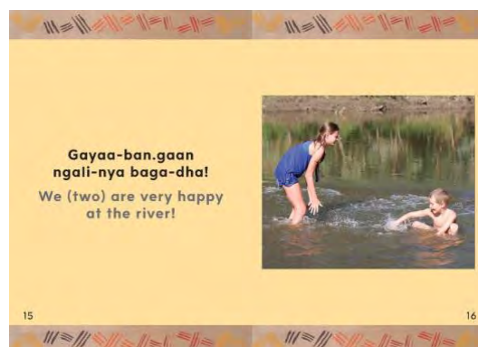
Figure 4. Example of story reflecting local culture.

The same photographer suggested that the river is a popular focus of activity among children in Gunnedah and important in local culture and tradition. Consequently, we carried out a further photographic session with her and the older children of another Winanga-Li staff member for the book Baga-dha-At the River (Smith, 2019c), shown in Figure 4.