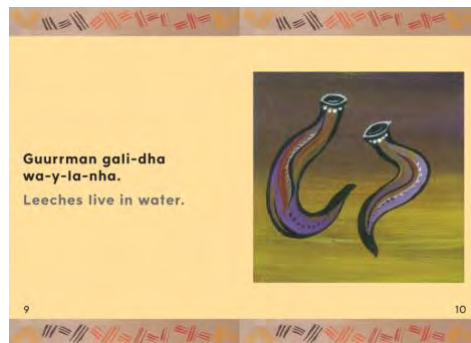
Figure 2. Example from book using local artist's work.

Since staff members often talked about children staying with their grandparents, we organised a photography session with a Gamilaraay teacher who is a keen photographer and the granddaughter of a staff member. The story Gundhi-gu Badhii-ngu-To Nan's House (Smith, 2019b) was then developed from the resulting photos, shown in Figure 3.