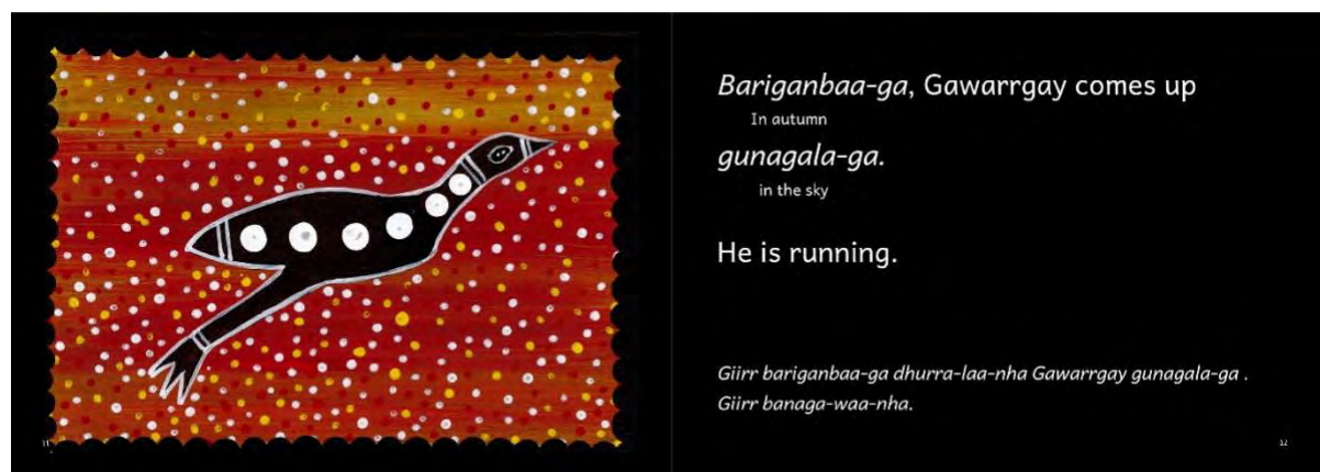
Figure 8. Example from the draft book with translanguaging.

This is a pragmatic approach to pedagogical translanguaging, which has the aim of developing the children’s bilingual repertoires rather than utilising them, as in the original uses of the term (Cenoz & Gorter, 2020). Although translanguaging has been seen as a threat to minority languages when the socio-linguistic context is not adequately taken into account (Cenoz & Gorter, 2017), our approach is embedded in local context. A translanguaging approach has been advocated for senior high school Indigenous students who speak creoles and related varieties in Queensland (Carter et al., 2019), but to our knowledge it has not previously been articulated in early childhood language reawakening contexts. In a situation where total immersion in Gamilaraay language is not yet possible, our approach is a form of “sustainable translanguaging” (Cenoz & Gorter, 2017). Seals and Olsen-Reader (2020) discuss the benefits of sustainable translanguaging for language revitalisation, emphasising that