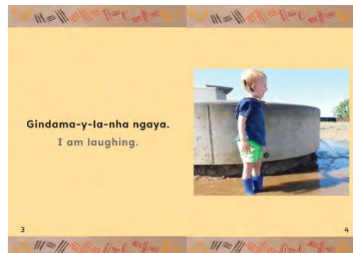
Figure 5. Example from story developed from photographs.

Our final book was based on the flashcards we had developed for teachers to use in counting from one to ten; Maabuba-la-Let's Count! (Smith, 2019e). This used commissioned artwork by another Gamilaraay artist who has links to Winanga-Li, as shown in Figure 6.