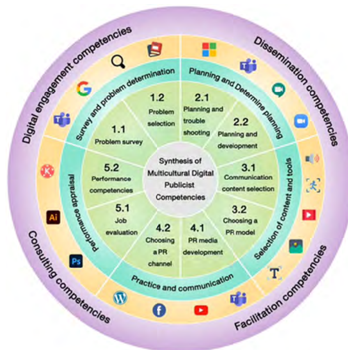
Figure 3. Multicultural competency training for digital publicists

Developed multicultural competency training model for digital publicists consists of 3 main components: training management process, digital technology tools used in training management, and assessment of digital publicist competence, which has details as the following picture.