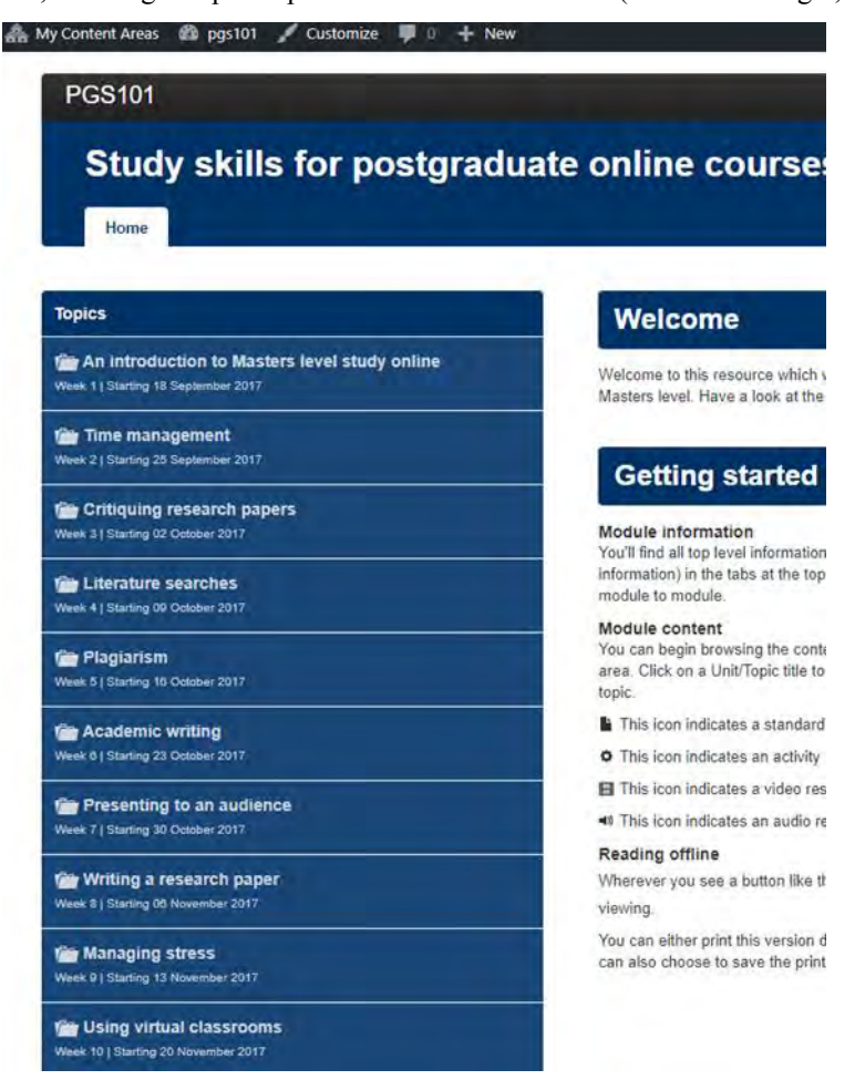
Figure 2. The online academic skills course for masters students

community and how masters (in the sense of experts) in the community carry out the skills required to conduct and disseminate research, enabling full participation in the academic CoP (Lave and Wenger, 1991, p95).