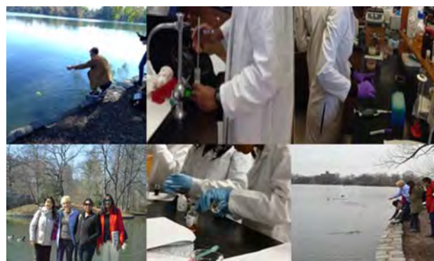
FIGURE 4. Selected Images of Faculty and Students at Collection Sites and Performing Laboratory Analyses

values indicate more dissolved ions (which are necessary to conduct electricity) such as phosphate or chloride anions, or calcium or sodium cations (EPA, 2012a). Prospect Park Lake appears to be on the lower end of conductivity; lakes and river water in the U.S. are typically 50–1500 µS/cm (EPA, 2012a). The level of dissolved oxygen in water is temperature dependent. Colder water typically has higher levels of dissolved oxygen (EPA, 2012b). Stagnant water contains less dissolved oxygen. This was observed in sites 2 and 3, as the water was stagnant. These two sites also had the lowest dissolved oxygen levels. According to the United States Geological Survey (USGS) (2018), as organic matter decomposes, "bacteria in water can consume oxygen," which may also point to why the