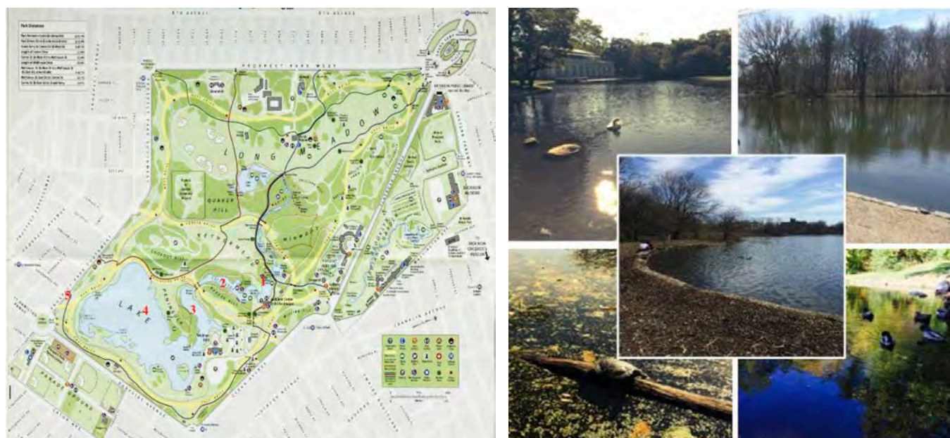
FIGURE 2. Map of Prospect Lake and Images from Water Collection Sites

The project attempted to investigate the key question "What is the water quality in Prospect Park Lake?" The project activities were hands-on and exploratory, and encompass the scientific process from the microbiology, chemistry, and mathematics perspectives. The students worked as a team throughout the whole project. They went on field trips to Prospect Park, made observations of the park habitat, and collected water samples from the lake. A map of Prospect Park Lake is provided in Figure 2, showing the water collection sites numbered 1–5 in red. These accessibility sites were defined by the Prospect Park Alliance. Next, 50-ml water samples were collected in sterile tubes from the five sites in the lake. To avoid bacterial growth, the water samples were stored at 4°C in a cooler. After water collection, the team of students reconvened in the laboratory and performed chemical and microbial analysis (Figures 3 and 4).