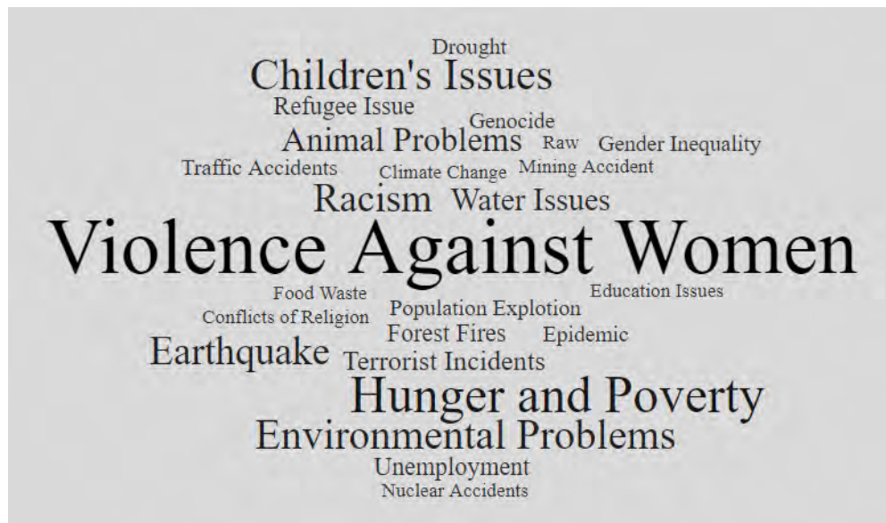
Figure 1. “Current World Problems” that most affect Social Sciences pre-service teachers.

problems” (air, water, soil pollution, etc.) with 8%. "Earthquake" (7.2%), "racism" (7.2%), "poverty" (6.2%), and "animal problems" (violence, abuse, extinction of animal species) (5.4%), were among the other problems.