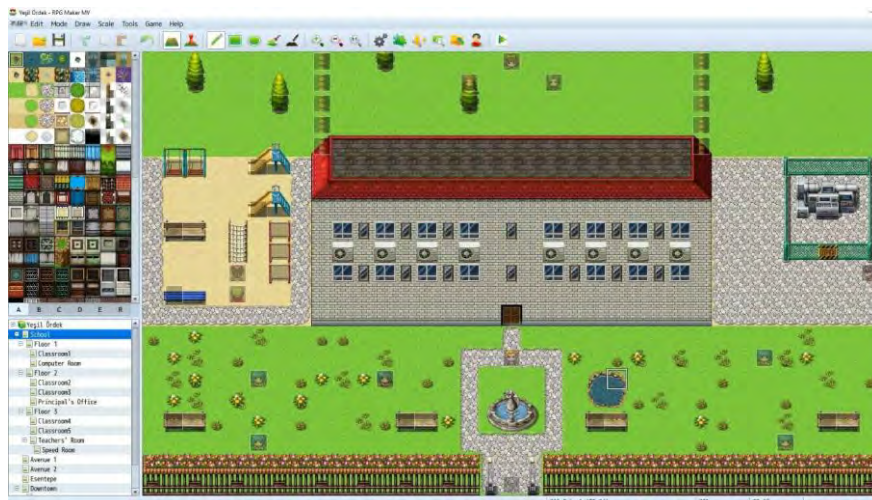
Figure 1. Map Creation

The researcher developed the game by using the RPG Maker game engine. The map on which the game is played was created based on a small town where the students live so that a familiar and exciting environment could be created for them (see Figure 1). Once the map was developed, the characters that were also based on the students' real-life teachers were created, as well.