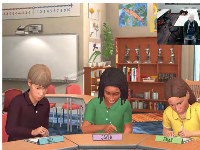
Figure 2. Example of MRS session

Similar to the clinical interview assignment mentioned above, the tasks implemented during the MRSs were of the cognitive guided instruction type (Carpenter et al., 2014) and covered several elementary mathematics concepts (e.g., join or separate-change unknown, measurement or partitive division).