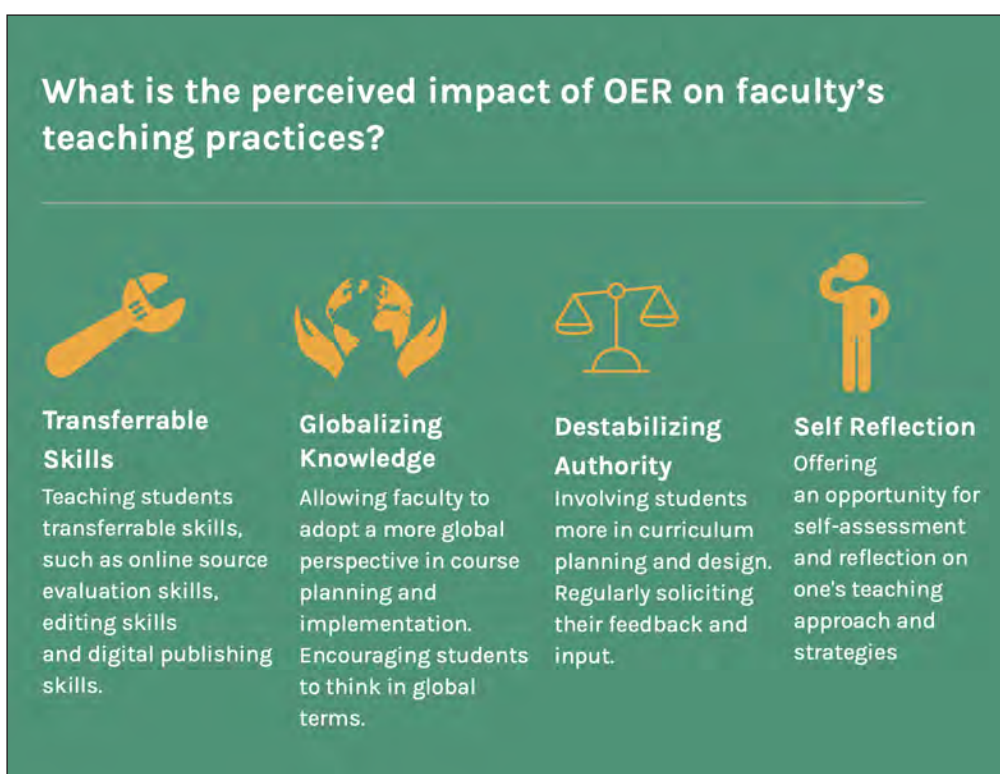
Figure 2 Themes that emerged as faculty described how OER is impacting their pedagogy.