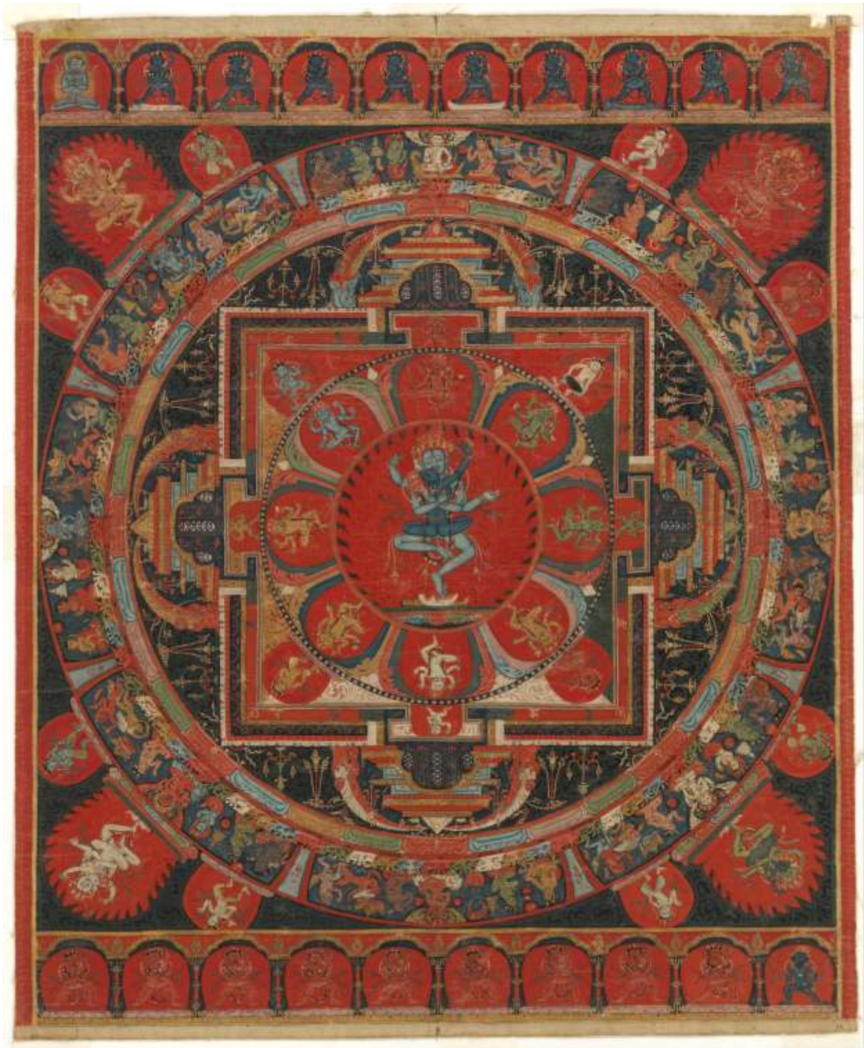
Vasudhara Mandala dated to 1777 (Samvat 897)

pre-service teachers may begin to understand the psychodynamics of such conflicts and the ways they may be depotentiated in the future thereby transforming their pedagogy. Since some readers may not be familiar with some of the terminology presented in this paper, a glossary of terms has been provided.