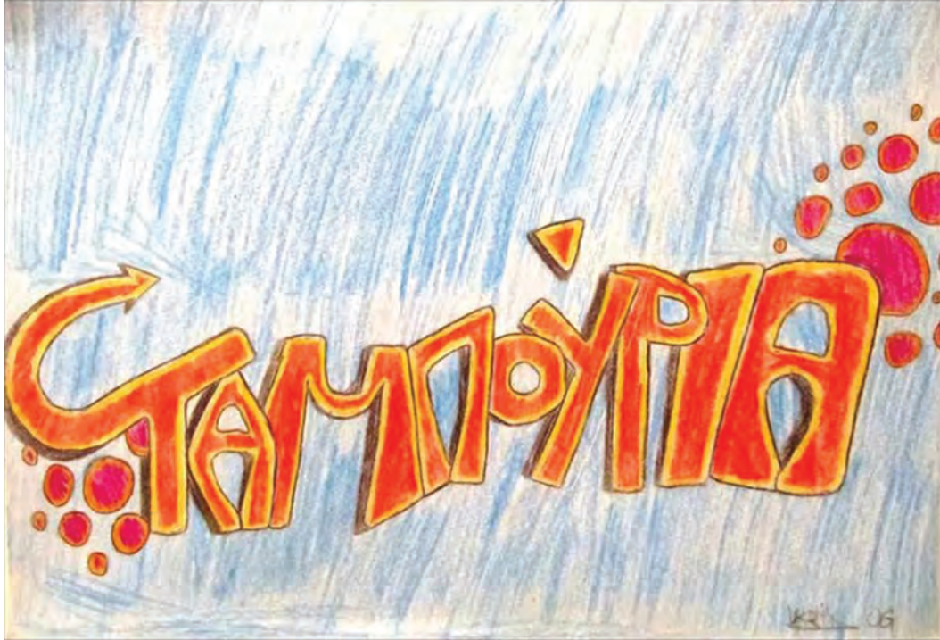
Figure 2: Screenshot from the documentary showing the last graffiti shot

a series of images in their minds formed by the reading of history books, exposure to archive material in school settings, documentaries, family narrations (with and without the use of visual material such as photographs) and a broader cultural memory of past experiences inherited from the communities of which the students were a part.