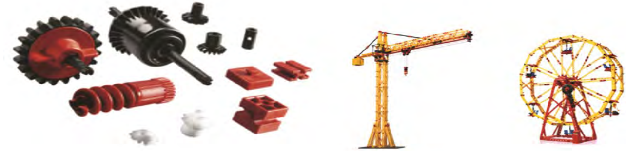
Figure 1. Some parts of Fischertechnik engineering sets