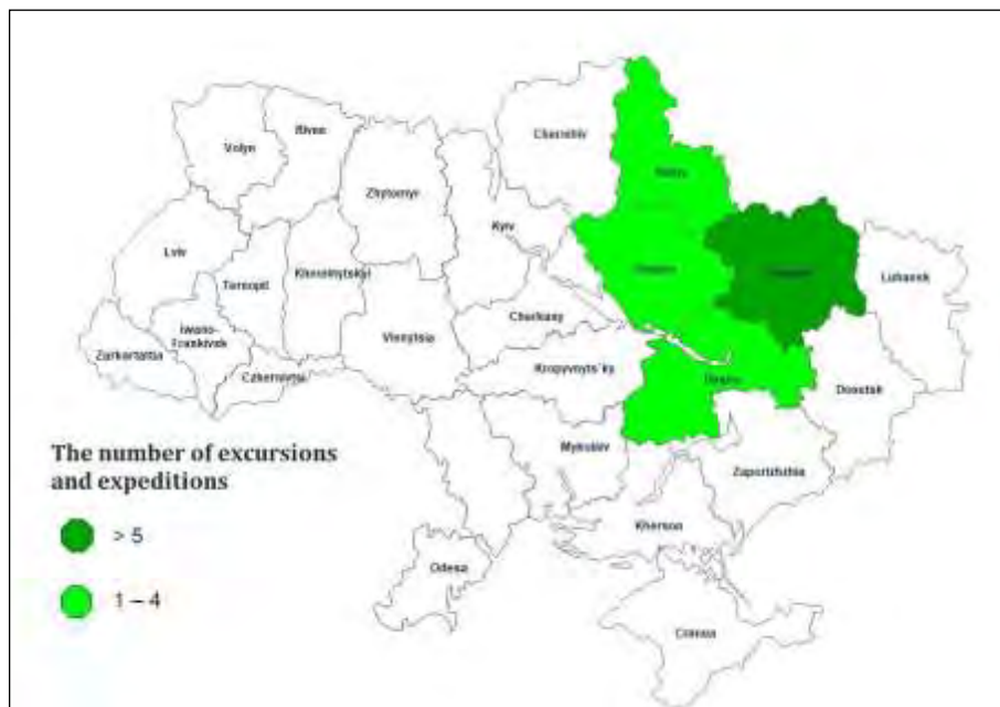
Figure 2. Geography of Excursions and Expeditions of the Participants of Local History Educational and Productive Practice in 2013–2019.

Excursions and expeditions corresponding to the theme of the conducted theoretical classes contribute to the deepening and mastering of the theoretical course. During such field trips, students have the opportunity to visually explore the sights of the region, to get acquainted with the methodological foundations of the tour. Thus, before the COVID-19 pandemic and the introduction of related quarantine restrictions for trainees, we organized excursions and expeditions in Kharkiv region and adjacent regions – Sumy, Poltava and Dnipropetrovsk (see Figure 2).