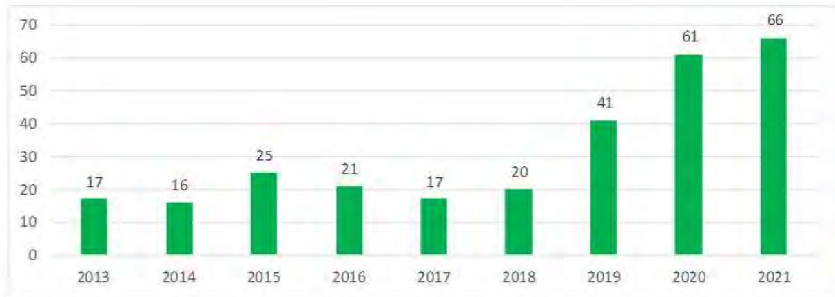
Figure 1. Dynamics of the Number of Students, Taking Part in the Local History Educational and Productive Practice in 2013–2021

The first stage of local history educational and productive practice is to theoretically prepare the students to choose the topic of the project they will develop. According to the lesson plan developed by the heads of practice and specialists from basic institutions, the students attend classes, and this deepens their knowledge in the chosen direction of local history research. Such classes are organized directly on the premises of the Academician P. T. Tronko Center for Area Studies, V. N. Karazin KhNU, in museums, on the streets and historical sites of Kharkiv and the region. In this case, resources of distance learning systems can also be used to organize classes.