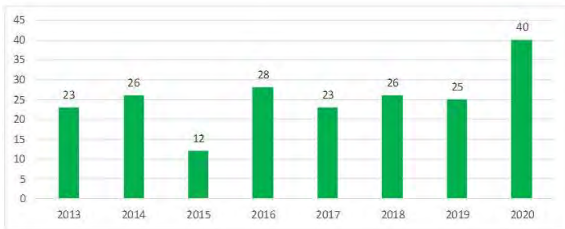
Figure 4. Participation of Students of the School of History, V. N. Karazin KhNU in the International Local History Conference of Young Scientists (2013–2020)

After passing the local history educational and productive practice, students have the opportunity to continue their local history research and present it to the general public. First of all, it takes place within the framework of the International Conference of Young Scientists, held annually in December at the School of History of V.N. Karazin KhNU.