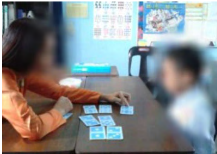
Figure 1. Daisy demonstrated point to count strategy

In the interview, Daisy elaborated that: