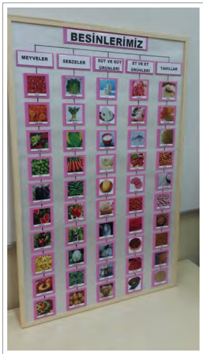
FIGURE 1: An example concept map. (1) Nutrients. (a) Fruits. (b) Vegetables. (c) Milk and milk products. (d) Meat and meat products. (e) Cereals.

Concept maps (see Figure 1) were ordered from the simple to the complicated. Eight concept maps related to items of food, clothes, animals, getting to know their bodies, professions, vehicles and sky were generated and separated into hierarchies in accordance to certain characteristics suitable to children's perceptions.