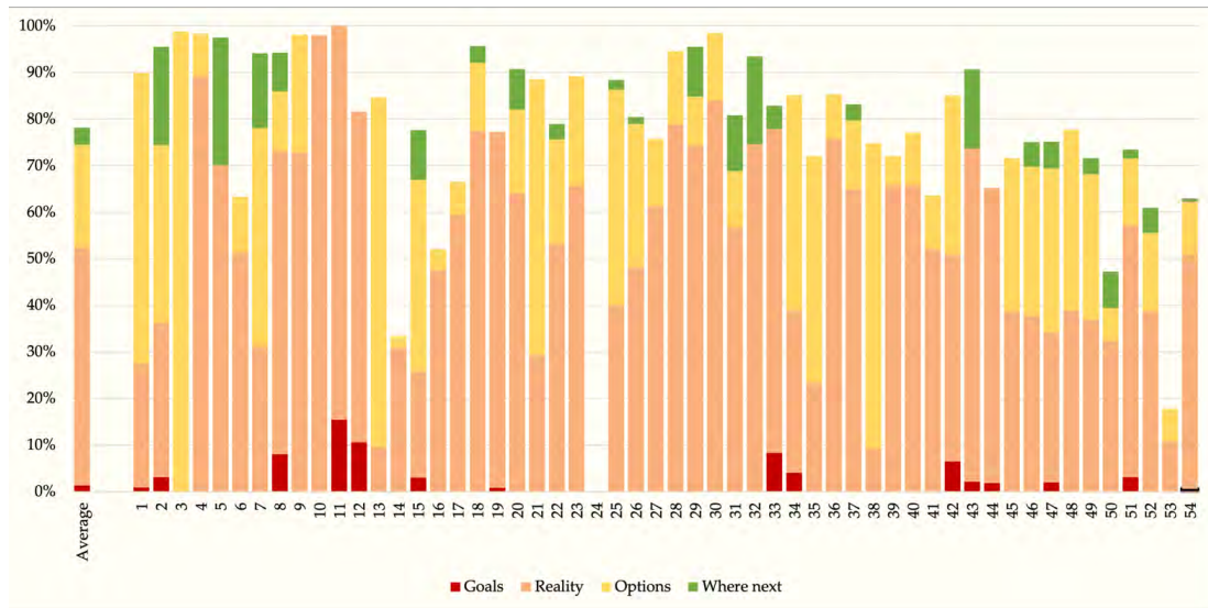
FIGURE 1. Proportion of GROW components during post-lesson mentoring conversations.

Figure 1 depicts the proportion of Goals, Reality, Options, and Where Next in each of the 54 mentoring transcripts. The proportion is expressed as a percentage of the total words in the transcript.