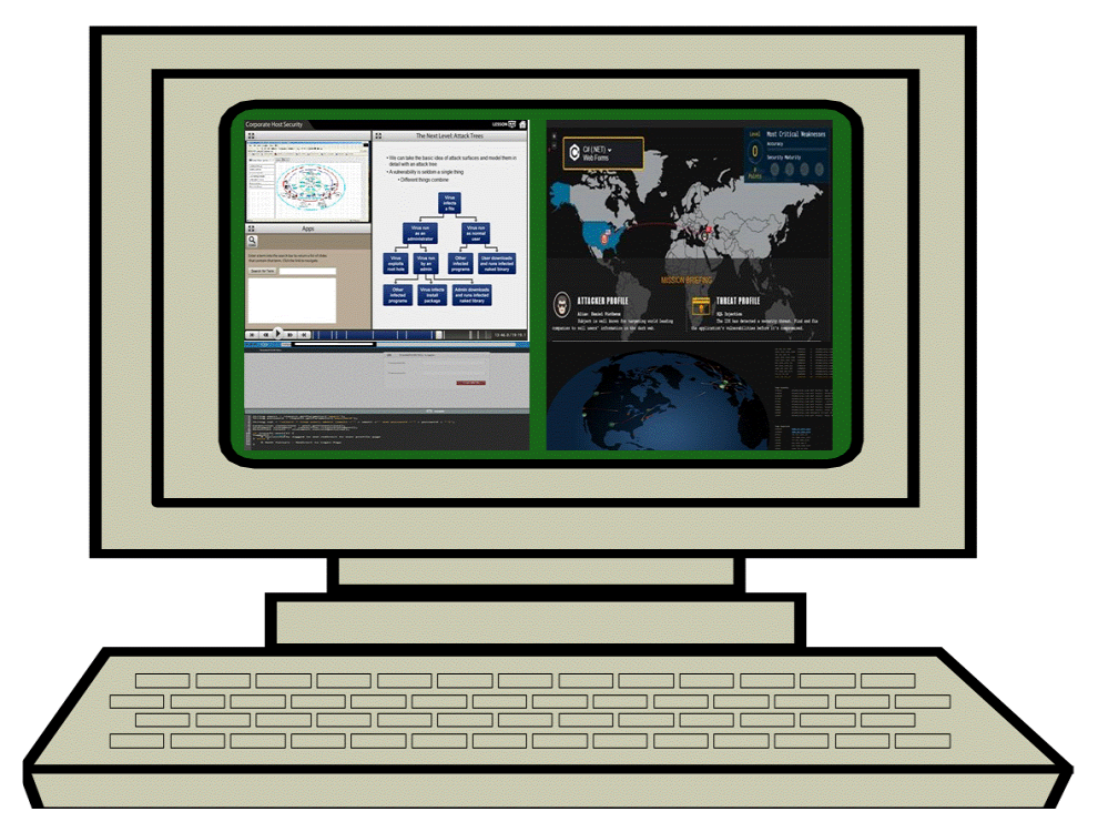
Figure 2: Sample Fixtures and Panes for Integrated Simulation

At the end of the course for all four sections, students underwent an assessment. The assessment tested analytical and procedural skills, in other words, how well students identified vulnerabilities and took appropriate actions. This was done by two means. This first part were timed case studies of attacks, countermeasures, and remediation. The case studies were based on real incidents, and presented all the facts but did not specify the flaw(s). The participant had to correctly identify the main vulnerability, and any additional issues. One case study, for instance, presented a problem in which open-source Web Application Firewall (WAF) was misconfigured to allow too many permissions, violating the least-privilege principle. This was followed by a Server-Side Request Forgery (SSRF) attack, and subsequent failures by humans-in-the-loop to notice the alarms from the monitors that signaled unusually large downloads from Amazon Web Services (AWS) S3 buckets. Case studies had clear and definable vulnerabilities and remediation solutions.