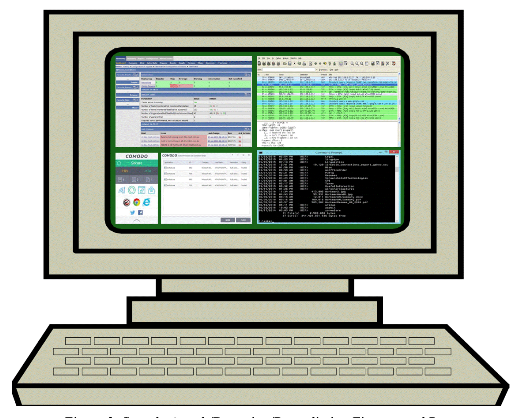
Figure 3: Sample Attack/Detection/Remediation Fixtures and Panes

Five hundred points were allotted to this assessment, for which students received T-Shirts and mugs, but were not included in the students' grades. The case studies were worth 1/2 of the points with 1/2 allocated to the lab. These were used as the dependent variable performance scores in the analysis.