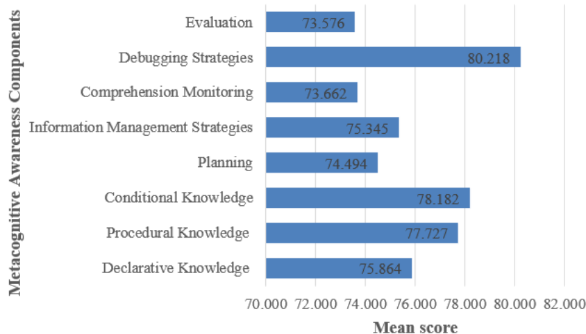
Figure 2. The profile of students' metacognitive awareness in each component

the effects of hybrid project-based learning (Husamah, 2015) and the use of Google Classroom in hybrid learning (Susilo, Kartono, & Mastur, 2019).