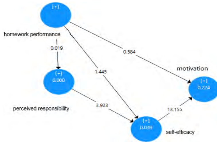
Figure 2. The correlation among online homework (homework performance), perceived responsibility, self-efficacy beliefs (self-efficacy), and motivation levels of students in Foreign Languages College