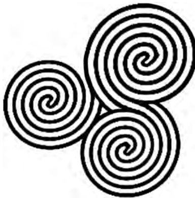
Figure 3. Being members of different CoPs or moving on from one to another

This article investigated the professional development of successful ELT professionals through their careers as teachers, teacher trainers or leaders in ELTAs, in order to identify their motivation for professional growth and taking leadership positions within their associations. The contingent paths of these experts were examined through the lens of legitimate peripheral participation in CoPs ( Lave & Wenger, 1991 ). From the biographical approach to the participants' life histories four distinctive stages were clearly identified. First, the motivational influences for CPD before ELTA involvement, with a clear progression in studies and interest in professional-cultural mobility. Secondly, the first successful encounter with sharing expertise with colleagues in a protective environment, which often leads to taking on smaller voluntary positions in CoPs. The transitional phases between these stages indicated that success in knowledge transmission and the influence of significant others also played a crucial role for CPD and volunteer positions.