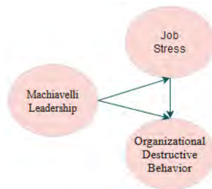
Figure 1. Model of the research

In the Machiavellian and exploitative leadership style, the leader has little confidence in their subordinates and leader-follower relationships are based on fear and intimidation. In such an environment, employees have little control over what they do and thus have low self-esteem. Under these circumstances, managers force employees to do specific assigned tasks within a short time, or they exercise strict control over employees. In such a situation, employees will experience job stress (Beiginia & Kalantari, 2008). Due to weaknesses in their positive behavioral and functional capacities in establishing healthy human relationships, such leaders provide a psychosocial stressful environment in the workplace, which results in the incidence of destructive behaviors in employees. Thus, the third research hypothesis can be stated as follows: There is a positive relationship between Machiavellian leadership and job stress (Golparvar & Salahshour, 2016). Thus, the fourth research hypotheses can be stated as follows: Machiavelli leadership has a positive and significant effect on the destructive organizational behavior through mediation job stress. The relationships between Machiavelli leadership, job stress, and destructive organizational behaviors can be illustrated as follows: