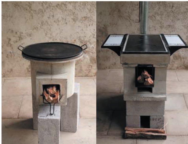
Figure 3. A) Ecocina cookstove (left) and B) EcoPlancha cookstove (right).

StoveTeam participates in multiple outreach events each year and regularly hosts service-learning trips for volunteers and students. Participating group itineraries may include cultural exchange, Spanish language immersion, leadership training and development, storytelling, photo-journalism and videography. In keeping with StoveTeam's mission of bringing stoves to communities and supporting local factories, StoveTeam requires each volunteer to support the cost of purchasing and distributing two Ecocina cookstoves (Figure 3A, http://www.stoveteam.org/projects/our-stove ).