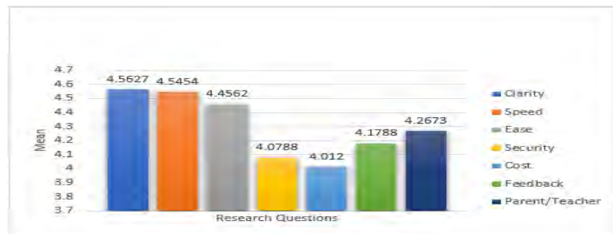
Figure 2: Distribution of questionnaire items by grand mean

The total mean values across items were calculated and the results are shown in Figure 2 below. The means data indicate that the effect of ICT has the highest impact on communication clarity (4.5627) and cost has the least impact (4.012).