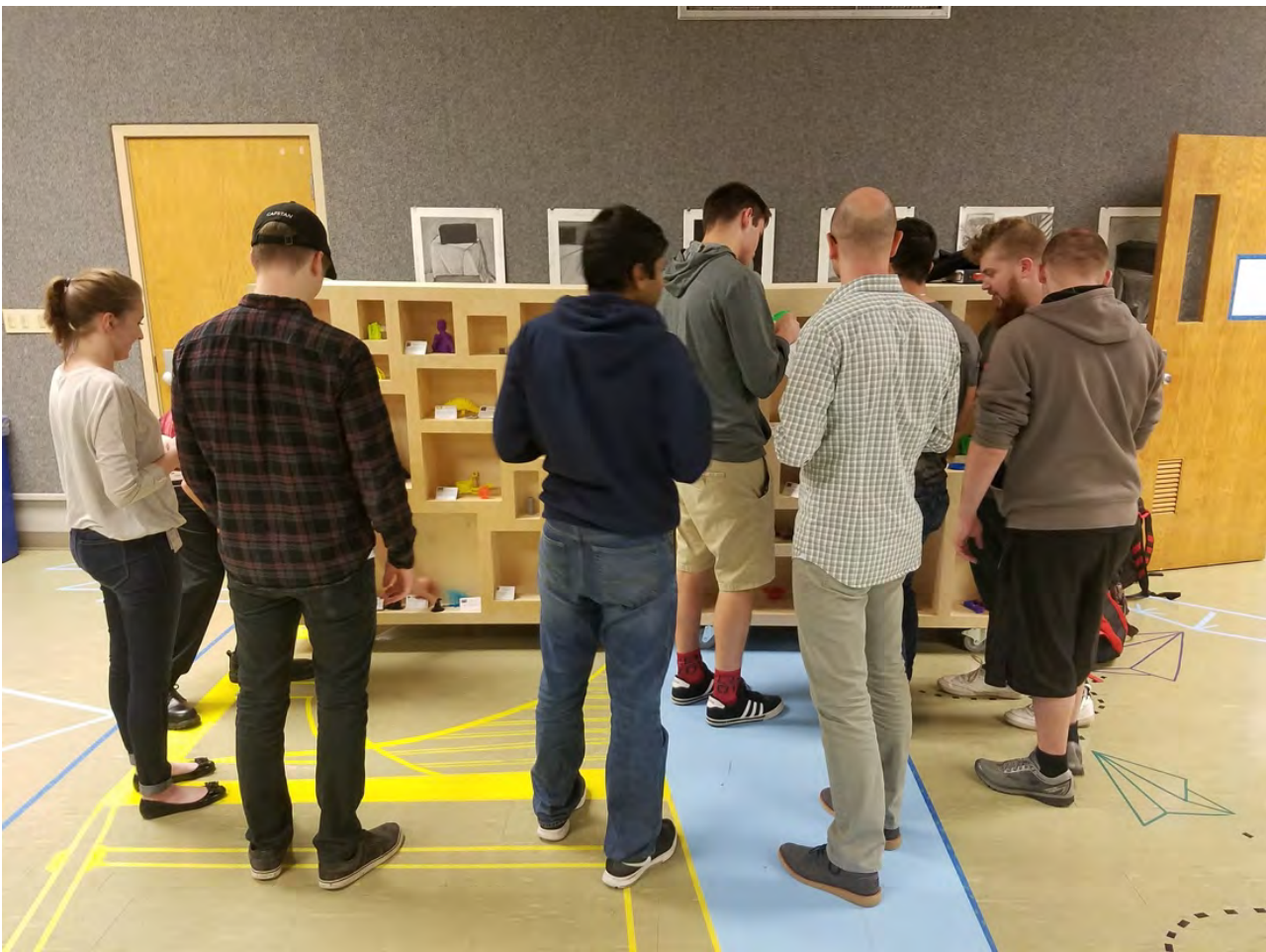
Figure 3. The Demonstration Gallery at a MAKE 3D event

we will summarize the evolving forms the Material to Form curriculum has taken, the conceptual framings that shaped those forms, and their affordances and constraints.