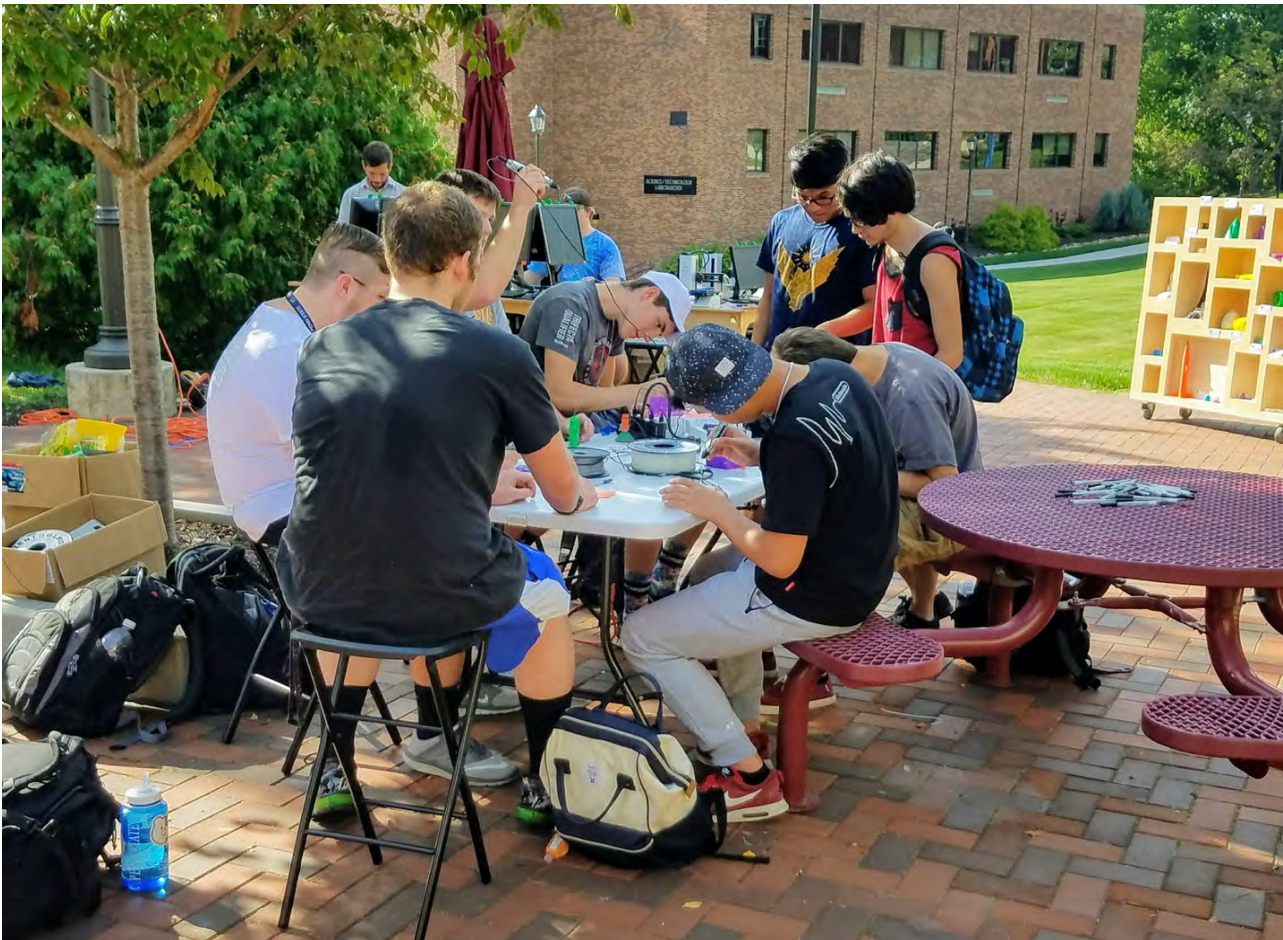
Figure 2. An example of the flexibility of the mobile makerspace installation. We were able to set up in this courtyard using an electrical outlet on a streetlamp post

deployed in a flexible configuration allowing the learning space to cater to the needs of the students and environment (Figure 2).