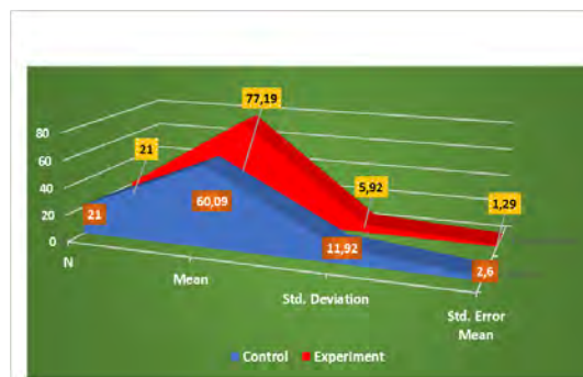
Figure 1: One-sample statistics of post-test scores on control and experimental groups

In general, the results of this study indicate the impact of the independent research variable on the dependent variable. However, it should also be stated that the level of difference in scores which is the basis for stating that there is a causal relationship is quantitatively above mean the category. The level of difference in data from pre-test and post-test to the two groups—control and experiment were at a level of significance. The results indicate that there is a difference in the average value between the group that received learning using SA and the group that did not receive treatment with the SA variable.