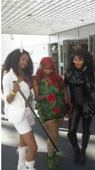
Figure 2. Author as Gwendolyn with fellow cosplayers Poison Ivy and Catwoman.

life. Therefore, to play mas is to be exposed to new erotic and ludic subjectivities. In turn, to examine Black women cosplayers who participate in convention hall costuming or via social media personae invite us to explore the undoing of rule, with the hall or hashtag as the opportunity (actual or virtual) to undo it. The rule here is an abstraction of humanism and colonial inventions in the form of pop cultural canons. For example, undoing a rule could be a curvy Black woman playing Poison Ivy, a petite Black woman playing Michelle Pfeiffer's Cat Woman, and me, playing one of the few black-skinned characters in Image Comic's Saga because I know the convention hall will be full of its other character (see figure 2).