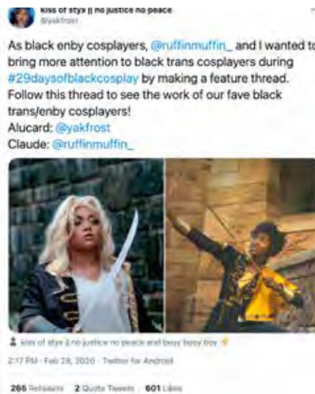
Figure 7. Black trans and nonbinary cosplayers in #28daysofblackcosplay.