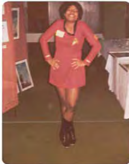
Figure 11. Nalo Hopkinson as Lt. Uhura from Star Trek in 1982.

Returning to Black Panther cosplay, I asked Hopkinson about her convention experiences with spectators at large and with people with whom she might consider part of a belonging-in group. These might be friends she knew or travelled with or other cosplayers identified as familiar—in this case, the Marvel Universe. On this point, she noted that “Black people, who culturally