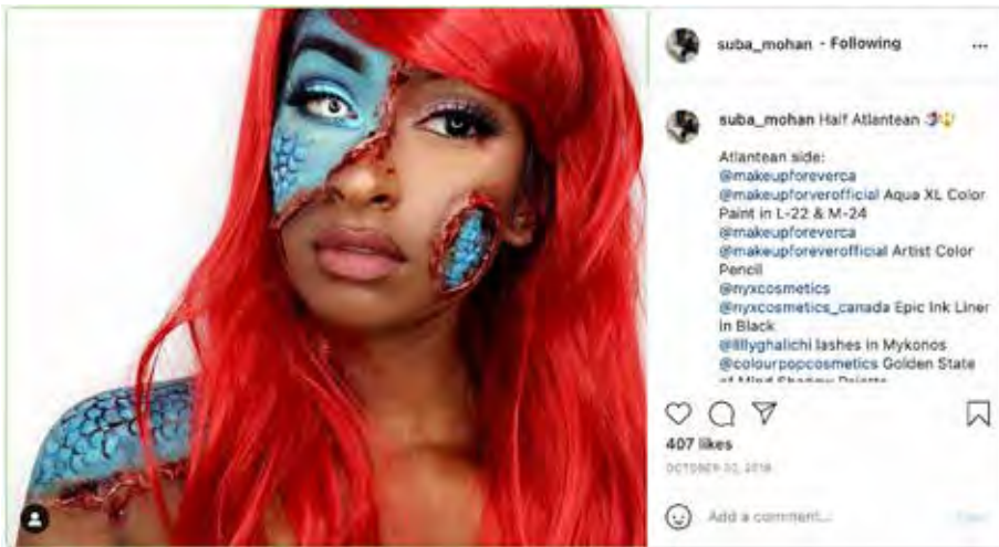
Figure 1. Half-Atlantean.

I connect Andromeda and the Blue Devil not only because they are visibly blue but because the consequence of their physical appearance makes their play—and, thusly, in this case their Caribbean-rooted narratives—more visible. In this way, Blackness at play can be seen as a form of critical fabulation in which the performance draws on and draws out the blanks left by the historical record and thus the canon (Hartman 2008). “By playing with and rearranging the basic elements of the story” and “throwing into crisis ‘what happened when’” the Black costumed players’ fabulations contest what has been laid out as fact, history, and event by imagining themselves as world builders who can narrate their presence and present (11). The blue devil player and this version of Andromeda are provisional projects who emerge from ludic impulses renarrating themselves with each Carnival, convention, and social media post. They are rhetorical and performative cognates.