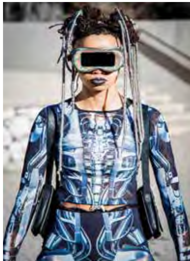
Figure 12. ZiggZaggΣrZ, Raging AfroSamurai Cycloptic Cyborg #1, Afrofuturist Occupation at Pomona College (2019).

In convention hall cosplay, it will be a person’s sublimated race, perceived gender, assumed ability, and body type that challenges the immanence trapped