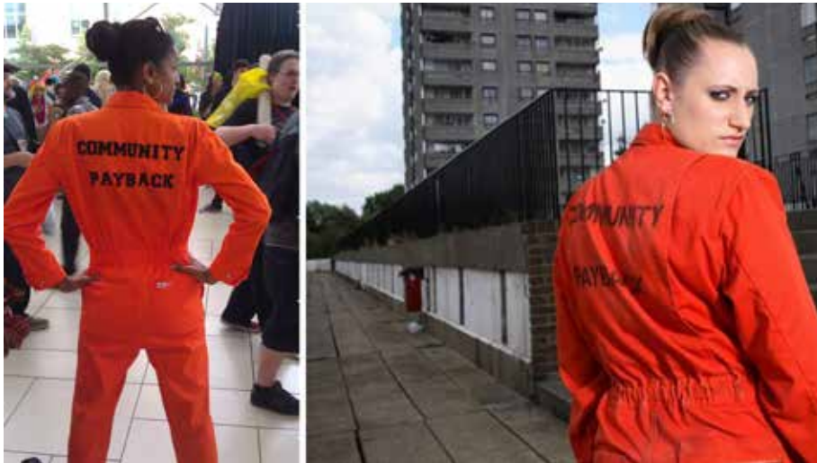
Figure 10. Author as Kelly Bailey from Misfits. and an image of the character Kelly Bailey.