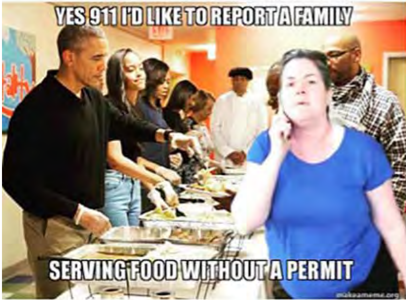
Figure 2. Meme shared widely on both Instagram and Twitter that reveals the faults of respectability in the conversation of white womanhood and the police state.