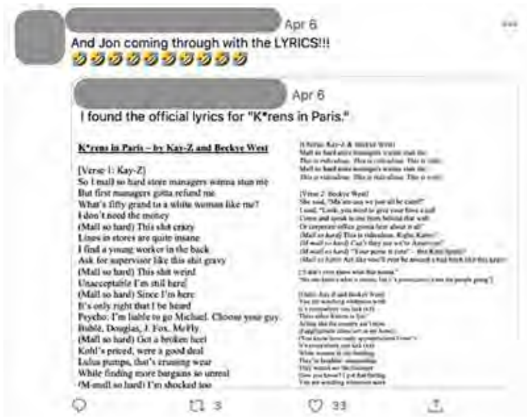
Figure 8. Example of Karen as Black humor showcasing creativity from Black users' experiences.