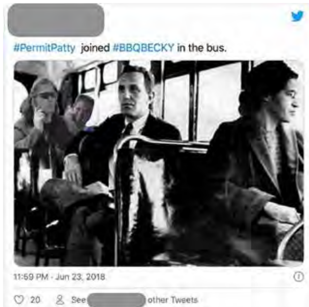
Figure 4. #PermitPatty and #BBQBecky combined into one meme that demonstrates the historical patterns of white supremacy.

Importantly, many of the hashtags and posts that included the phrase Permit Patty also included other white women calling the police unnecessarily, including