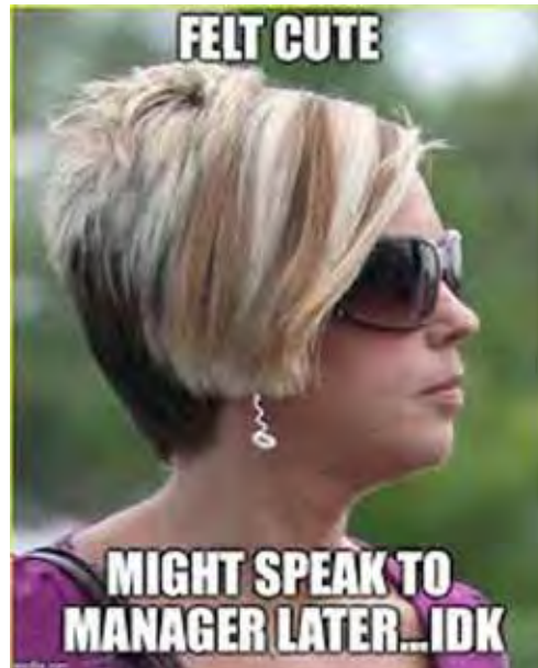
Figure 1. Popular Internet meme featuring “Karen” and humor as play

Still, the specifics of racialized practices, such as the links between Black humor and play, have yet to be seriously probed in relation to play studies. This article draws from the sociocultural perspective to explore the relationship between play, humor, and resistance by analyzing the digital practices of Black people, and specifically, #PermitPatty and #Karen, both characters created