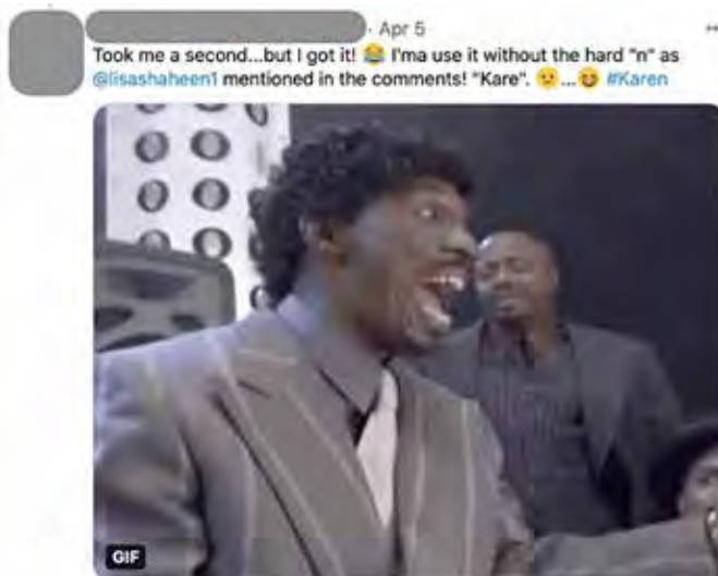
Figure 9. "Karen" inverted to be imagined as a racial slur.