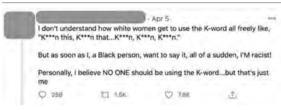
Figure 7. Example of Karen being used as an inverse in Black humor as play.

There are several layers of incongruities leading to Black humor as play and resistance in the Karen posts. First, the explicit use of the name Karen, as mentioned, serves to invert the stereotypical names (and by extension, the caricatures and tropes) of Black women with that of “pure” white women. Second, users add their own creative take to the story by inverting actual slurs that have led to insurmountable violence against Black people (e.g., the n-word). Doing so, hilariously points out the obvious: Until white women can show the historical damage done to them through use of the name Karen, their claims here are