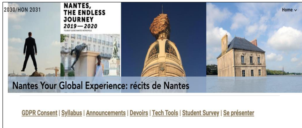
Figure 1 Course Website