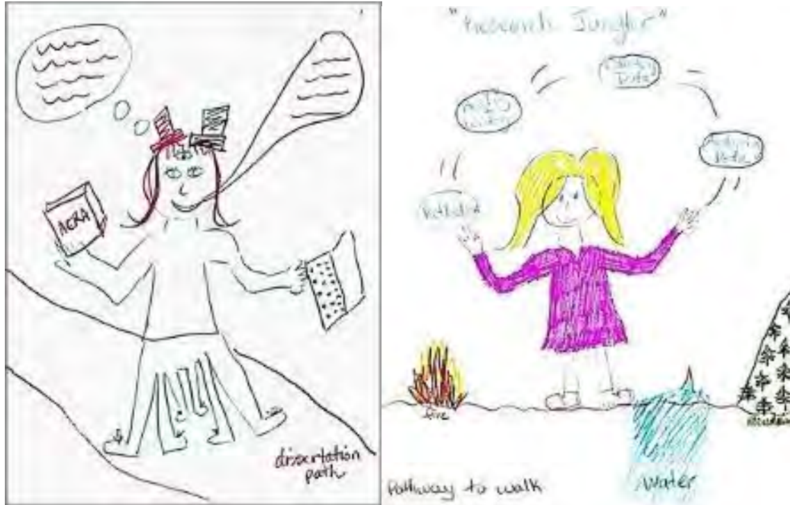
Figure 1. Diane's pre- and post- drawings for the Draw-a-Researcher Test

After examining her pre- and post- drawings (see Figure 1), Diana expressed: