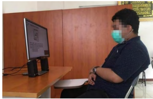
Figure 1: Participants sit relaxed facing the monitor screen with a distance of 60-70 cm